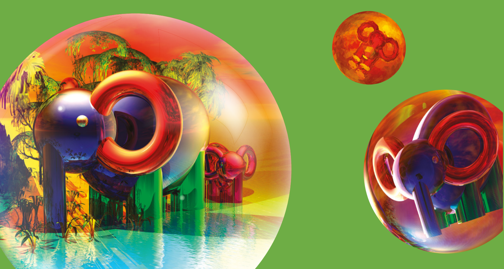
Adapted from: "The Philifant" 2001. Phil L. Herold. © Copyright Phil L. Herold. All rights reserved.